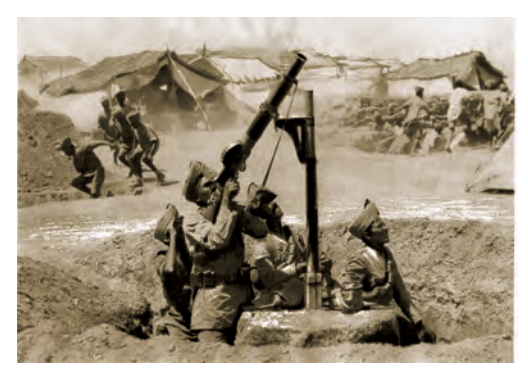
Indian Soldiers on a battlefield in the First World War

League of Nations was established after the First World War to establish peace. But it did not succeed at preventing war. Autocratic regimes came up in Germany, Italy, Spain and other countries. All these developments culminated in the Second World War.